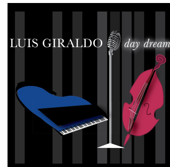
Day Dream 2002