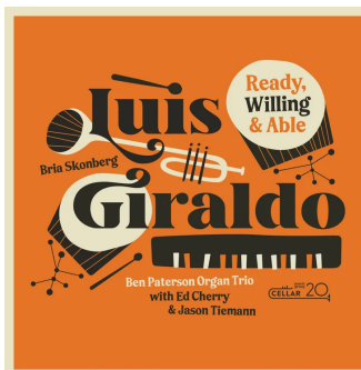
Ready, Willing & Able 2023 · Cellar Music